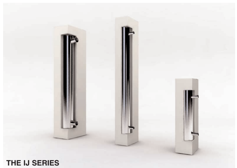
THE IJ SERIES